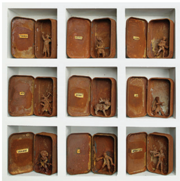
Things Never Look as Scary or Violent in Miniature

Nietzsche said repetition is the “concept of the eternal return, as the power of beginning, and beginning again.” There is comfort in the knowing.