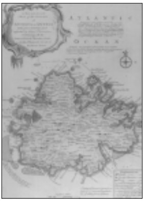
Emanuel Bowen's 1744 map of Antigua