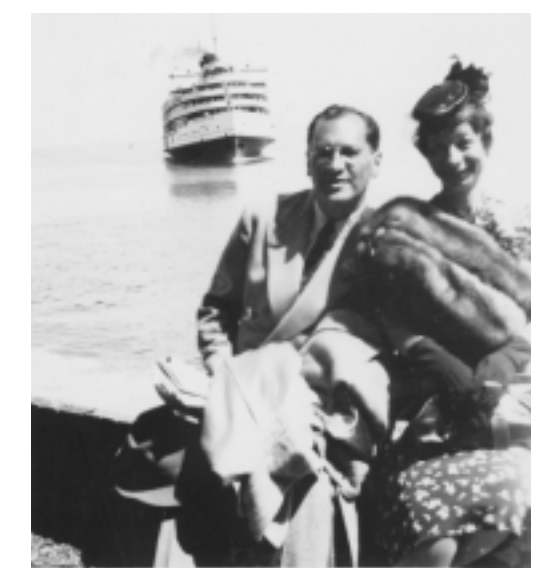
August 4, 1945