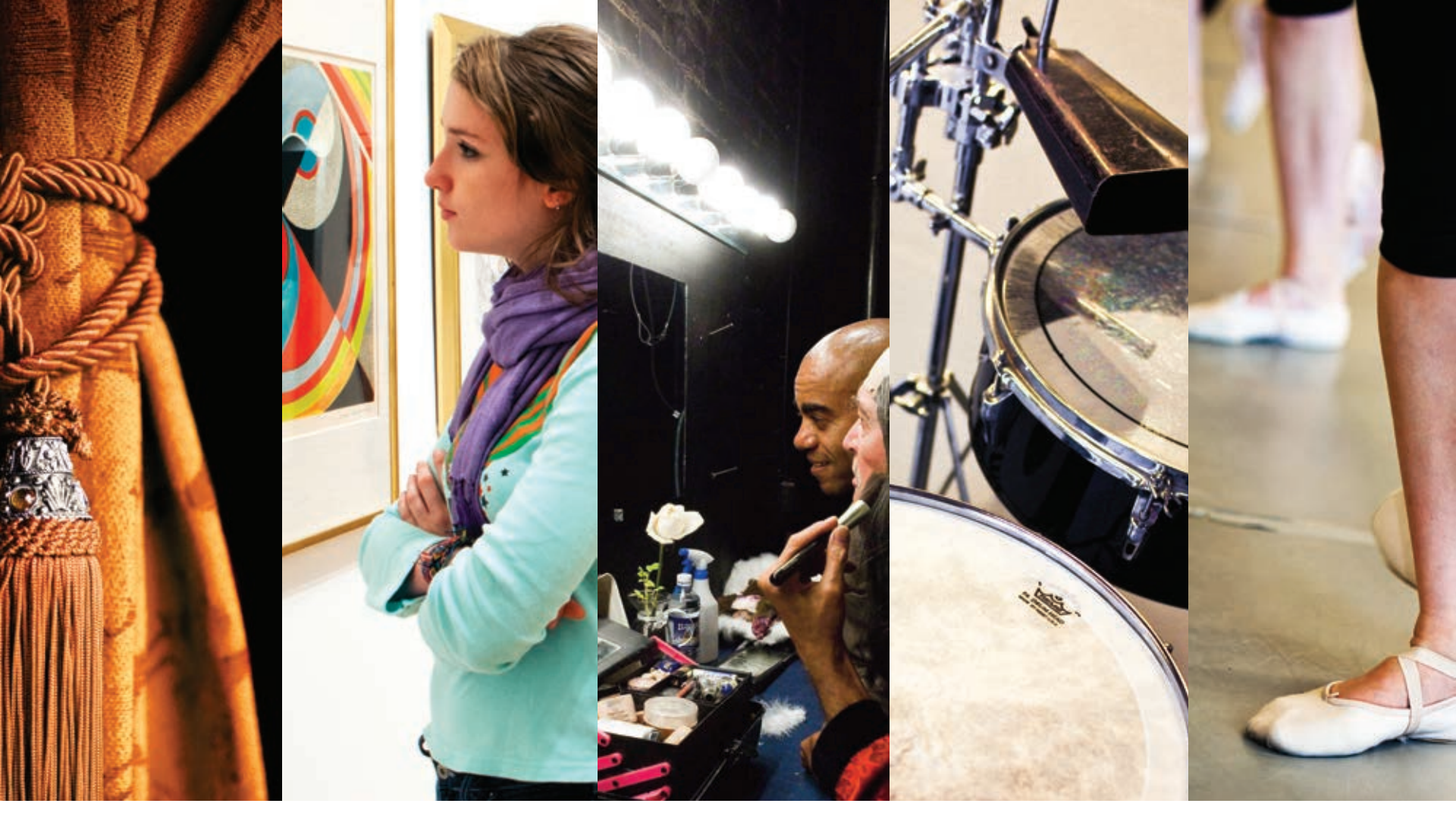
GOUCHER COLLEGE ::: Master of Arts in Arts Administration