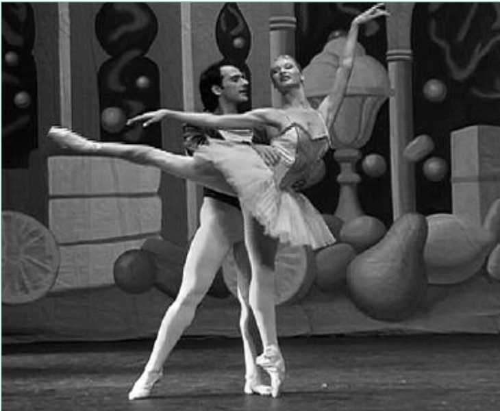
The Baltimore Ballet presents a full-length production of The Nutcracker on 12/12 and 12/13.