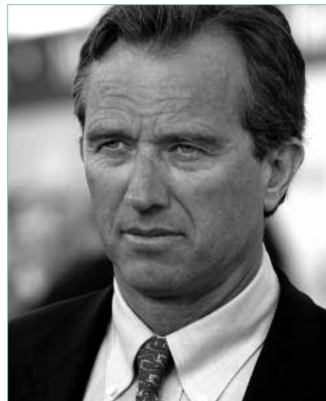
Robert F. Kennedy Jr. will speak on 11/11 in Kraushaar Auditorium as the Fall 2009 Robert and Jane Meyerhoff Visiting Professor.