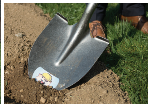
Representatives of Goucher's Board of Trustees, alumnae/i, faculty, staff, and student body (plus the gopher) came out to break ground on the first-year village.

On Friday, May 8, Goucher College broke ground on a new residence hall that will begin a complete re-envisioning of how students live and learn on campus. Nearly 200 Goucher students, faculty, staff, alumnae/i, trustees, and other community members gathered on the lawn of Froelicher Hall to celebrate the initiative—as well as the philanthropic support that is spurring it.