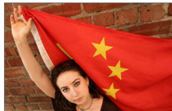
Enlarge