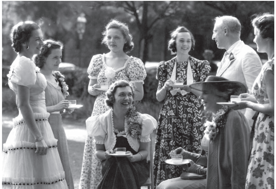
Mary Fisher Tea celebration, an image from Archives Digital Image Collection

"Creating publically accessible digital collections of Goucher's unique materials will increase awareness and use of the library's collections and services and promote some of what makes Goucher unique," said Tara Olivero, curator of special collections and archives. This past spring, a few months into the